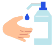
Hand Sanitizer at entrance/exit.