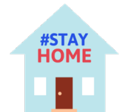
Stay Home if sick.